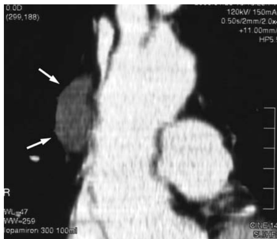
Fig. 1. Case 1. Chest axial tomography with enhancement shows a semicircular cyst on the right side of the ascending aorta.