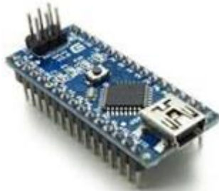
Fig.4 Arduino Nano