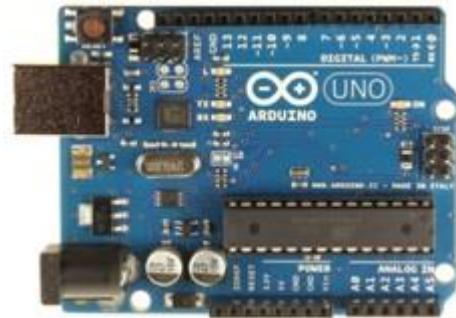
Fig.7 Arduino Uno R3 Module

microcontroller. Programs can be loaded on to it from the easy-to-use Arduino computer program [9]. The Arduino has an extensive support community, which makes it a very easy way to get started working with embedded electronics. The R3 is the third, and latest, revision of the Arduino Uno. The Arduino Uno is a microcontroller board based on the ATmega328. It has 20 digital input/output pins (of which 6 can be used as PWM outputs and 6 can be used as analog inputs), a 16 MHz resonator, a USB connection, a power jack, an in-circuit system programming (ICSP) header, and a reset button.