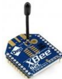
Fig.3 ZigBee Module

ZigBee is a low-cost, low-power, wireless mesh network standard targeted at battery-powered devices in wireless control and monitoring applications. ZigBee delivers low-latency communication [6-8]. ZigBee chips are typically integrated with radios and with microcontrollers. ZigBee operates in the industrial, scientific and medical (ISM) radio bands: 2.4 GHz in most jurisdictions worldwide; though some devices also use 784 MHz in China, 868 MHz in Europe and 915 MHz in the US and Australia, however even those regions and countries still use 2.4 GHz for most commercial ZigBee devices for home use. A data rate varies from 20kbit/s (868 MHz band) to 250kbit/s (2.4 GHz band).