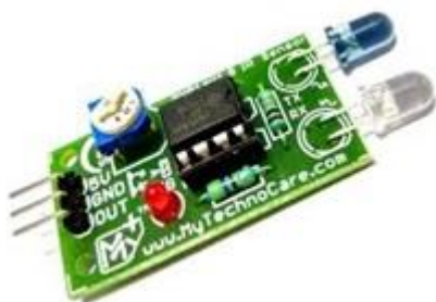
Fig.6 IR Sensor

IR sensor is an electronic device produce IR waves. IR sensor frequency range varies with the cost and these radiations are invisible to our eyes.