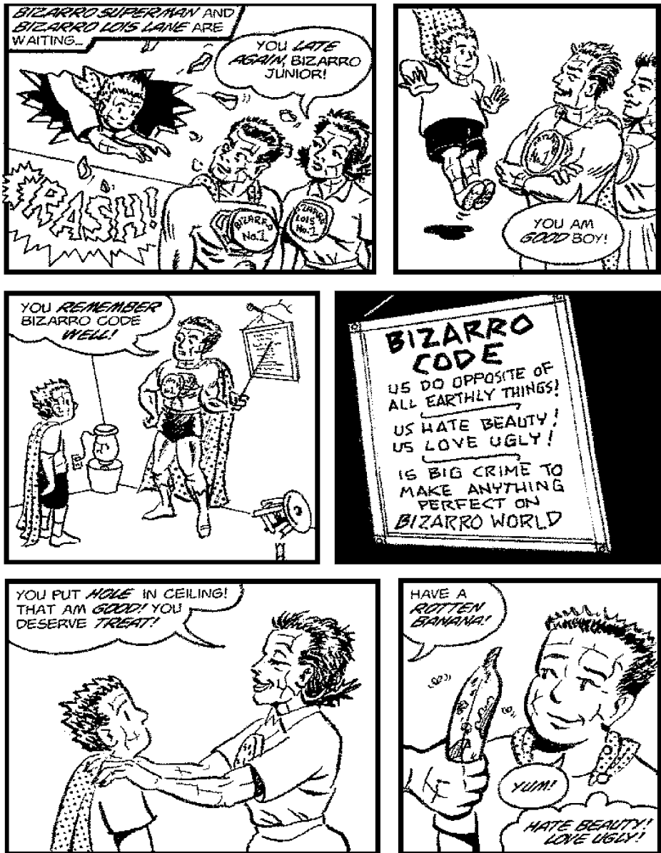
Fig. 8 “Bizarro Superman and Bizarro Lois Lane are waiting.” Ibid. p. 70