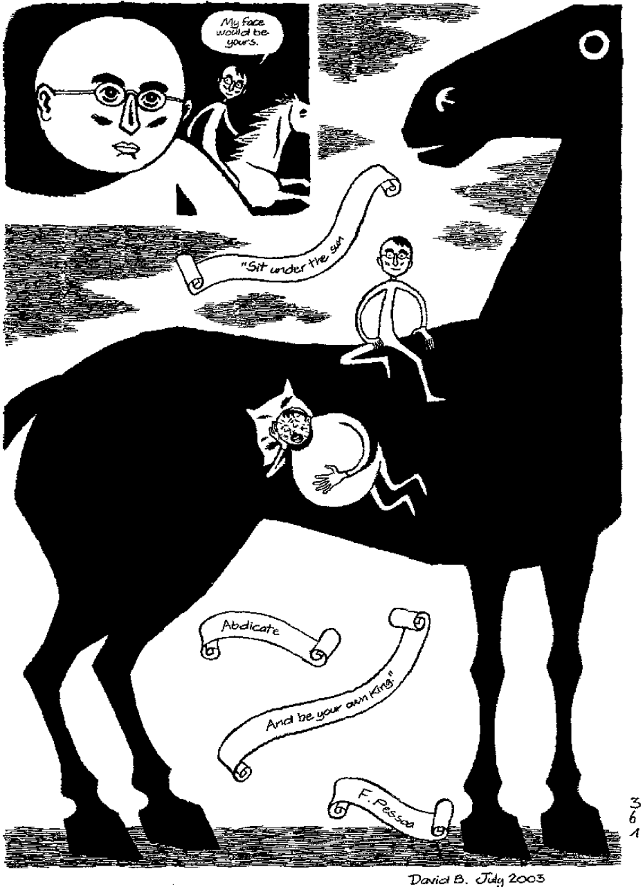
Fig. 6 "My face would be yours." Ibid. p 361

for-word re-creations, but condensed versions, featuring the pivotal moments of each scene, drawing on the language that drives the plot, like a storyboard of a show, or a series of friezes telling the familiar story of a holy figure moving through his destiny (32–33).