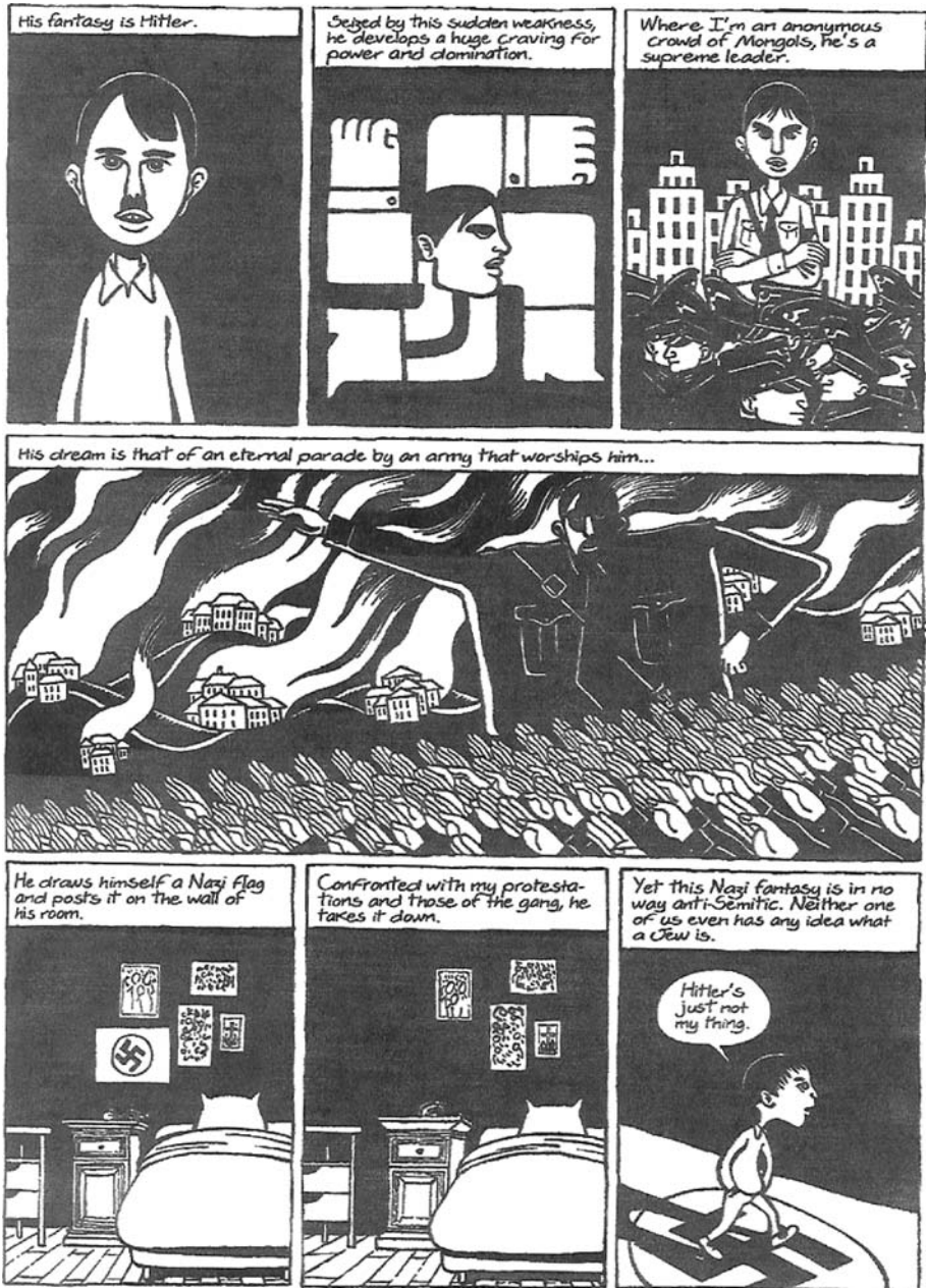
Fig. 4 “His fantasy is Hitler.” Ibid. p. 20

identification with the victims in the eternal battles that rage in his drawings, and he announces himself as a “professional” comic book artist. The drawing style changes: the comics take their subject matter from dreams and from the rich vein of esoteric literature. “Suddenly it seems obvious to me. Only fantasy books can make sense of the skewed reality in which I live (184–186).