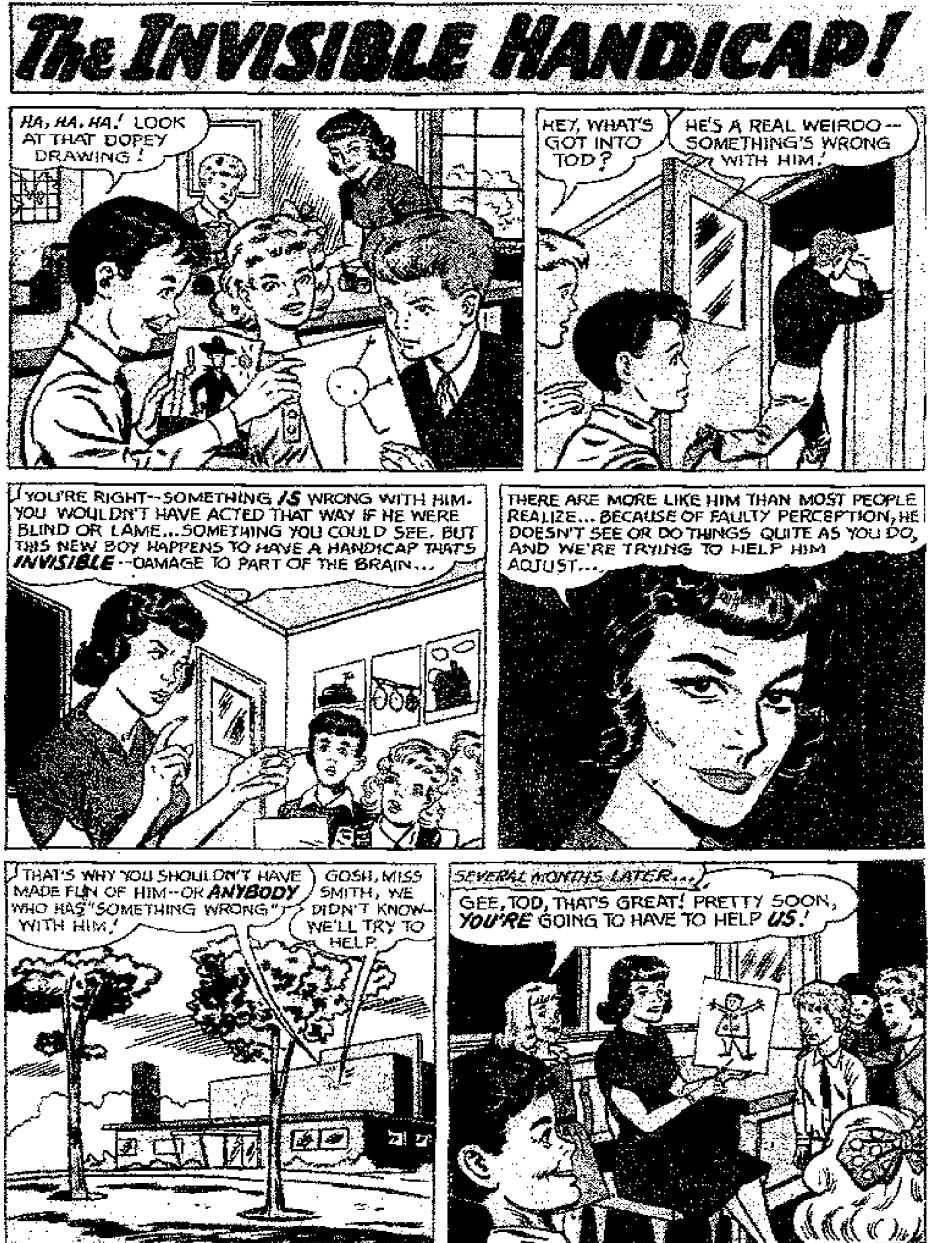
Fig. 9 "The Invisible Handicap!" Ibid. 72

The implications of Levinas's attention to an ethics grounded in facing and speaking, and his rejection of universalism in preference for the acknowledgement of alterity, can enable us to expand on the potential that comics and graphic fiction have for the full