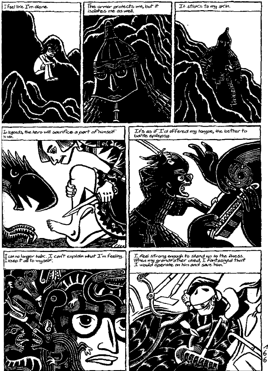
Fig. 5 "I feel like I'm alone." Ibid. p. 166