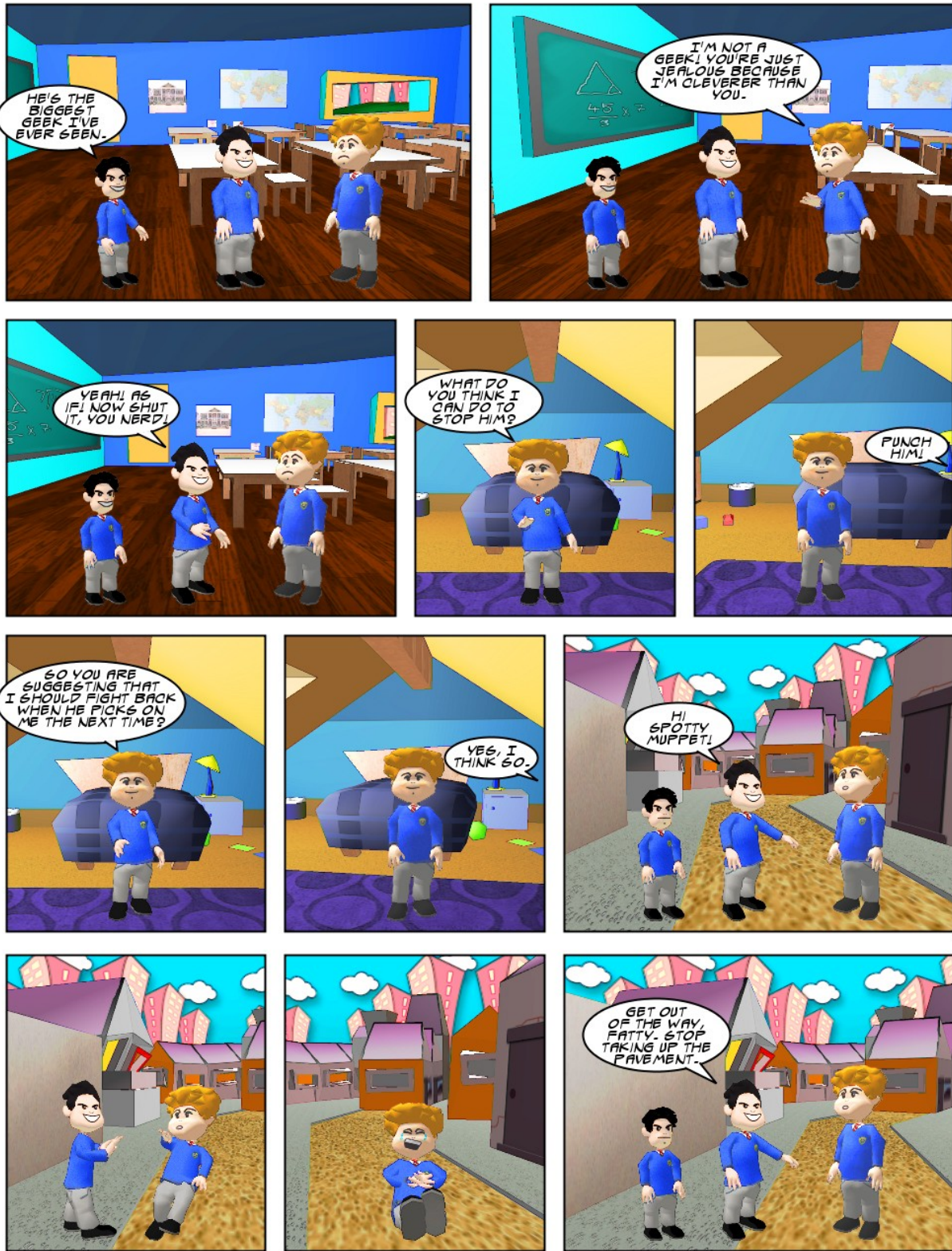
Figure 3. A segment from a comic strip created by our system depicting a story generated by FearNot!