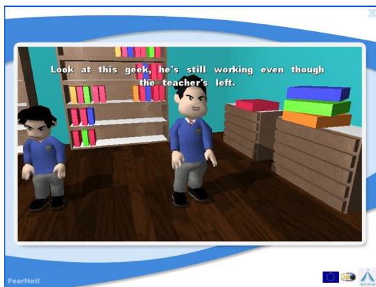
Figure 1. Bullying situation in FearNot!

The comics summarization system uses logs of stories generated by FearNot!. Fearnot! (Figure 1) is an interactive drama application that uses emergent narrative and a cast of autonomous characters to create improvised bullying situations which are unscripted by nature [2]. The user witnesses these virtual episodes emerge and helps the victim of bullying by suggesting coping strategies. The advice influences the character's behaviour in the next episodes without compromising its autonomy.