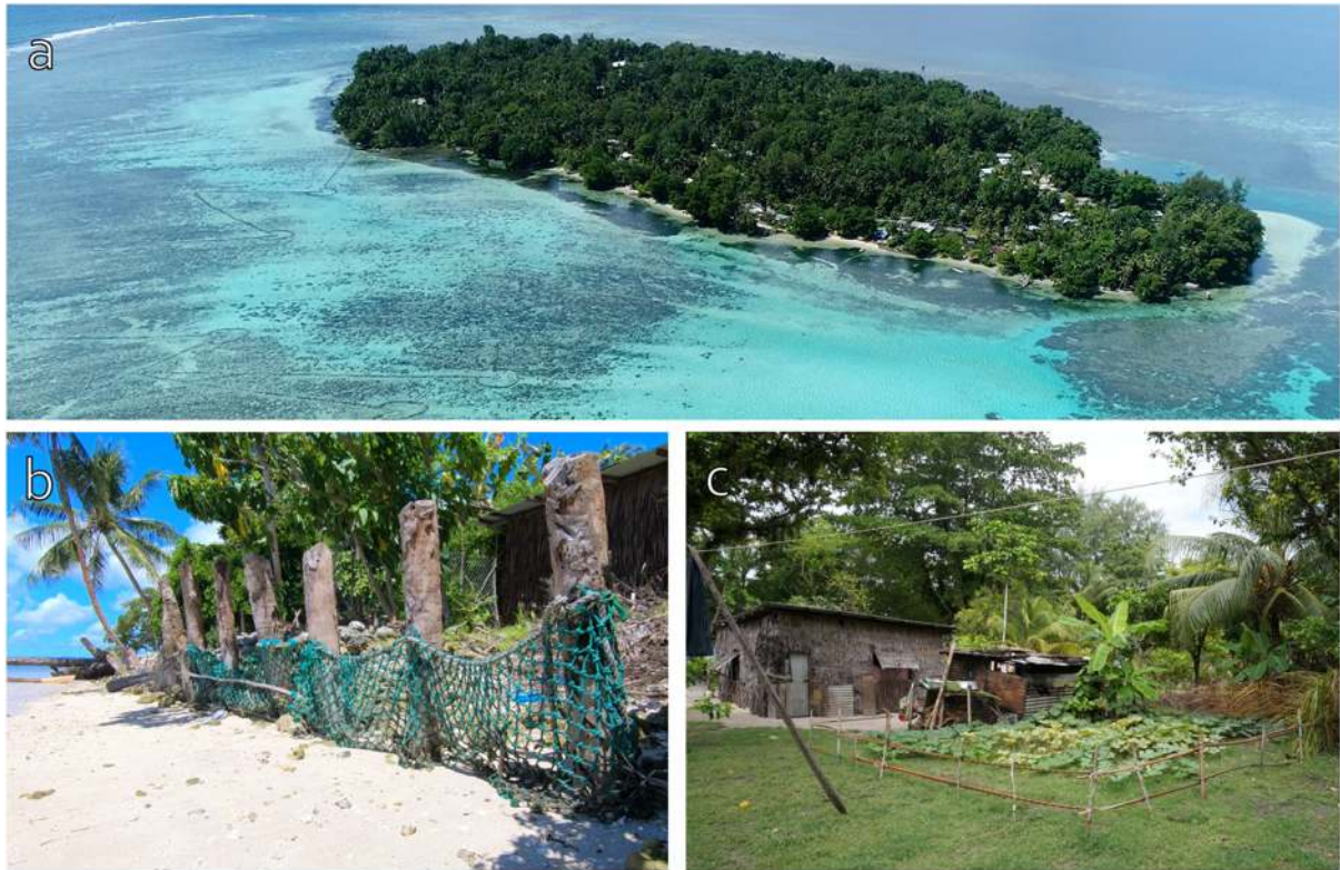
Fig. 1. Empirical context and examples of adaptive and transformative action. (a) An overhead view of the Papua New Guinean island where the research was conducted. (b) Construction of sea walls to protect existing land uses is an example adaptive action. (c) Engagement in atoll farming, a form of livelihood diversification which represented a fundamental departure from near complete dependence on traditional marine resource-based activities, is an example transformative action.

In this context, we integrate a full population census, semi-structured social surveys, key informant and expert interviews, observed fish landings, and published reports to document adaptive behaviours (Supplementary Table 1) and develop 20 key indicators (Table 1, Supplementary Tables 2-3; Fig. 2) representing the six broad domains of adaptive capacity (assets, flexibility, learning, organization, socio-cognitive constructs, and agency). Our indicators included social and economic characteristics, such as wealth and risk perceptions (Table 1, Supplementary Table 2), in addition to a household's position in a complex social-ecological network (Fig 2, Supplementary Table 3). Building on recent advances in network methodology (Autologistic Actor Attribute Models 28 ), we then developed a multilevel social-