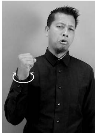
TIDAK-BISA (negative suppletive, citation form)

In addition to mouthed predicate constructions, there is a distinct manual suppletive form (TIDAK-BISA) meaning ‘cannot’, which grammaticalized from a sign meaning ‘difficult’ (Palfreyman, 2019, p. 70). These are regarded as grammatical variants because they constitute semantically and functionally identical yet morphosyntactically different means of negating the same predicate (see Palfreyman, 2019, pp. 207-215).