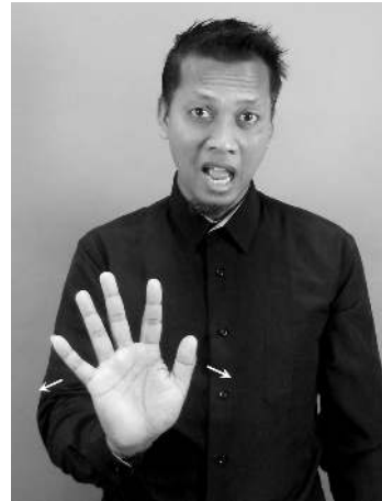
TIDAK (negative particle, citation form)