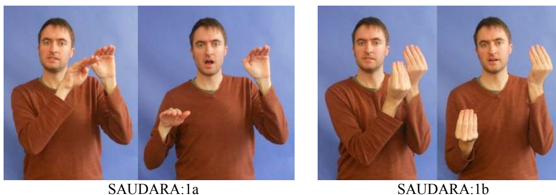
Figure 1. Two phonological variants meaning ‘sibling(s)’

The trigger for this discussion is the use, by Signer A, of a sign meaning ‘sibling’ that is different to the one with which Signer C is familiar. The two signs are glossed here as SAUDARA:1a and SAUDARA:1b (shown in Figure 1) and are regarded as phonological variants. Phonological variants are taken to derive either from a common original source, or from each other, through processes linked to morphophonological variation and change (Palfreyman, 2016, p. 276). In accordance with the way these terms are used in the literature, phonological variants tend to vary in one parameter, and have several other parameters in common.