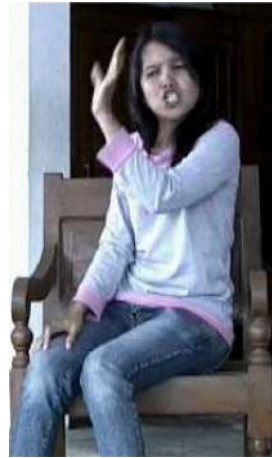
TIDAK + mouthing 'tidak bisa'