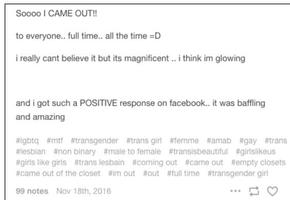
Figure 2. P3's post on Tumblr describing her trans identity disclosure to “everyone” on Facebook (used with permission).

People chose Facebook as a platform for mass disclosure because it was an efficient and official way to disclose trans identity to one's network, similar to how some use Facebook to disclose relationship breakups [38], pregnancy loss [4], and other life transitions. B92 described how making an announcement on Facebook was an efficient means of disclosure and allowed him to circumvent a series of individual conversations. Another blogger (B106) wrote, “ Sometimes I just want to come out on Facebook. Post the message, drop the mic, sign out. Come back in a week and see