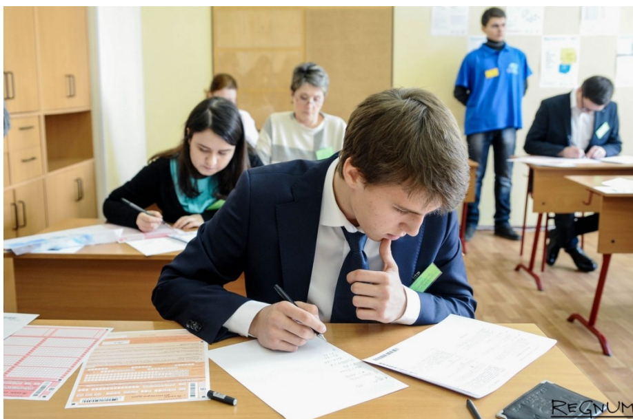
Figure 5: Schoolchildren in Kaluga pass the exam in social studies