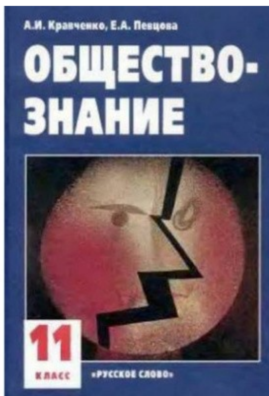
Figure 4: The textbook “Social Science” edited by A.I. Kravchenko and E.A. Pevtzova

The methodological apparatus of both series of textbooks, in addition to the text containing the necessary material, also includes questions and assignments on the topic, primary sources (texts), diagrams, tables (as explanations or assignments for schoolchildren), illustrations, and a dictionary. Some questions are marked as a “problem” or are problematic in content, however, most classes do not work with them due to the overloaded course and / or inertia of the methods of teaching social sciences. The main work is carried out with the content of the paragraph, the heuristic possibilities of additional materials are not taken into account.