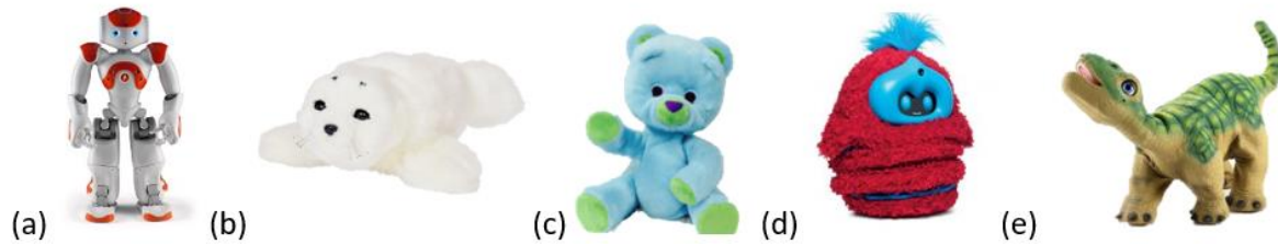
Fig. 1 Social robots used in the identified studies: Nao (a), Paro (b), Huggable (c), Tega (d) and Pleo (e)

of the sixteen included in the review mentioned what types of sanitation the robot require between interactions with children, two reporting on Nao being wiped down [43, 44] and one reporting on Huggable's fur being removed, wiped down and washed between interactions [39]. Sanitation methods are important, as the ability to sanitize the robot may determine its appropriateness to use in a hospital setting.