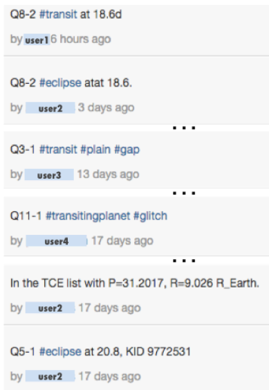
Figure 1. Participants employ self-constructed content patterns for testing hypothesis about objects of interest in the Planet Hunters project on the Zooniverse platform. Hashtags as well as identifiers from remote systems (e.g. the KID refers to an object in a public NASA database) let relationships between posts emerge. The system does not feature any explicit social network but the independent information sharing activities contribute to collective problem solving even spanning across the system boundaries of Planet Hunters.

phenomena are generally characterized by a socio-technical interplay that determines how applications and services on the Web are orchestrated for a particular purpose and how information diffuses.