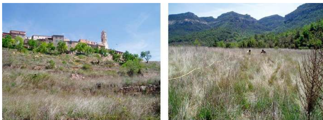
Figure 1. Photographs of the abandoned terraces and the village of Capafonts and of our study plot with the Prades mountains in the background (2017).

The village of Capafonts stands on a hill and was formerly surrounded by agricultural terraces. However, today, these have been abandoned to herbs and bushes. The vegetation that now surrounds the village makes it highly vulnerable to fire. Indeed, a wildfire in the forests of the Prades Mountains could easily be propagated to the village as a result of the inflammable vegetation on the terraces (Figure 1). In 2000, to eliminate this risk, firefighters set a PF to burn the vegetation on these terraces and create a firebreak around Capafonts. A second PF was set two years later, in 2002. Since that date, no more interventions have been taken on these terraces.