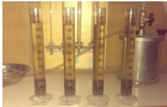
Figure 2. Free swell jars set for settling.