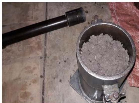
Figure 3. Standard proctor compaction test mold and rammer.