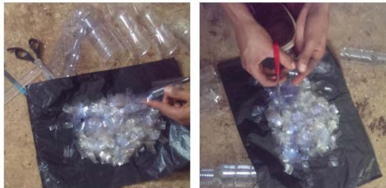
Figure 1. Strip preparation.

The characterization of the soil sample taken for this study included particle size distribution, Atterberg limit and specific gravity of soil tests. The sample soil taken was sieved in order to take out any other impurities and unnecessary particles. It was then prepared for testing according. Once sample preparation was done, sieve analysis and hydrometer analysis were conducted to study the particle size distribution of the soil. The tests were done as per [7] and [8] respectively. Plastic limit, liquid limit and plasticity index of the soil were determined