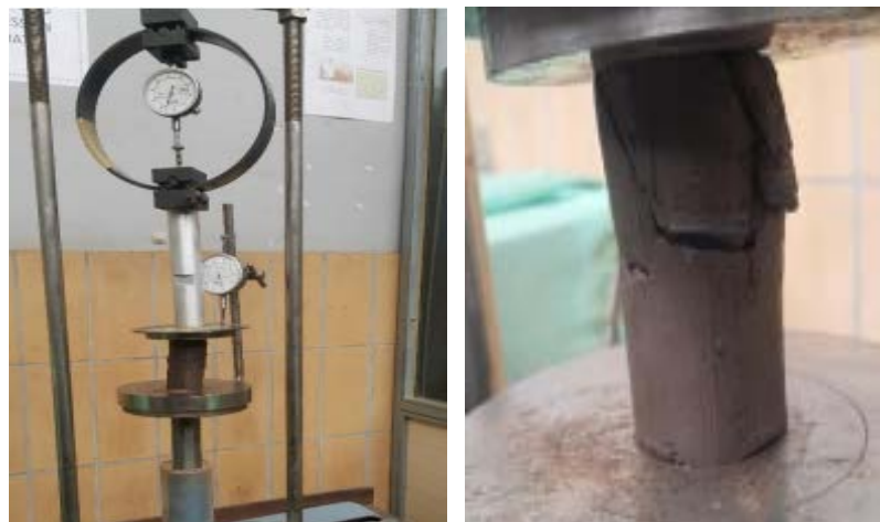
Figure 5. Unconfined Compressive Strength (UCS) test.