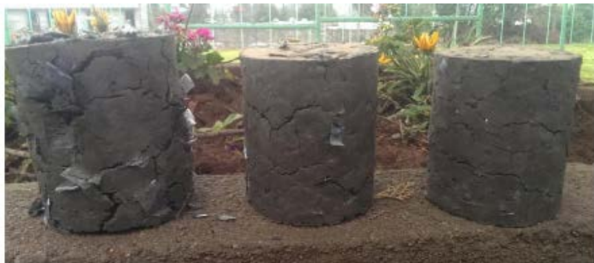
Figure 8. Comparison of cracking between soil samples.

The addition of plastic strips can help reduce the cracking and shrinking characters of the soil by bridging between the cracks. This was witnessed when the compacted soil was extruded from the mold and left to air dry until it fully cracked. The cracks outlined on the surface of the molded soil and its ability to maintain its original spherical shape were compared by visual inspection. The strip size of 5 \times 7.5 (mm) resulted a very considerable reduction of cracking, while larger sizes especially at higher percentages decreased the ability of the soil to maintain its spherical shape of mold. It was obvious that the larger surface area of the plastic, the easier for the soil to crack. Figure 8 shows the cracking mode of the soil for strip sizes 15 \times 20 , 10 \times 15 , and 5 \times 7.5 from left to right. It can clearly be seen from the figure that the sample containing 15 \times 20 plastic strip sizes showed excessive cracking.