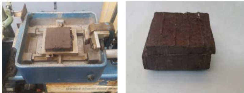
Figure 4. Direct shear test.

Cohesive soils can be evaluated based on their shear resistance when subjected to compressive load with no confinement. The unconfined compressive strength (UCS) test was used to determine shear capacity of the sample soil under compression. The sample was extruded and cut into the standard cylindrical shape. The UCS machine was used to compress the sample and both the applied load and change in length of the sample were recorded. The values were tabulated and computed to get one representative value. Figure 5 shows the UCS test machine and sample.