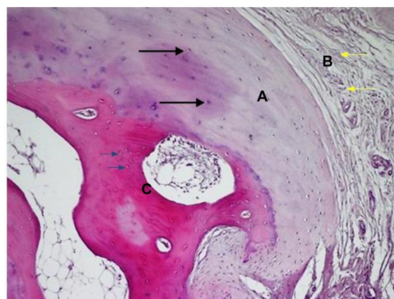
Figure 2 A histologic preparation of a synovial solitary osteochondroma (H&E, \times 10 obj) revealed the characteristic pattern of an osteochondroma covered by a thick cartilaginous cap formed with columnar arrangement of chondrocytes typical for osteochondroma (black arrows [A]). The fibrous capsule was adjacent to the fibrocartilaginous meniscus tissue (yellow arrows [B]). At the chondro-osseous junction, an osteoid matrix with osteocytes forming bony trabecula is apparent at the base of the cap (blue arrows [C]).

A search of the literature did not produce a previously published case of solitary synovial osteochondroma adjacent to the lateral meniscus directly located in the joint lateral compartment. An aim of this study was to emphasize the possibility of synovial osteochondroma during the differential diagnosis of osteocartilaginous loose bodies in the knee joint.