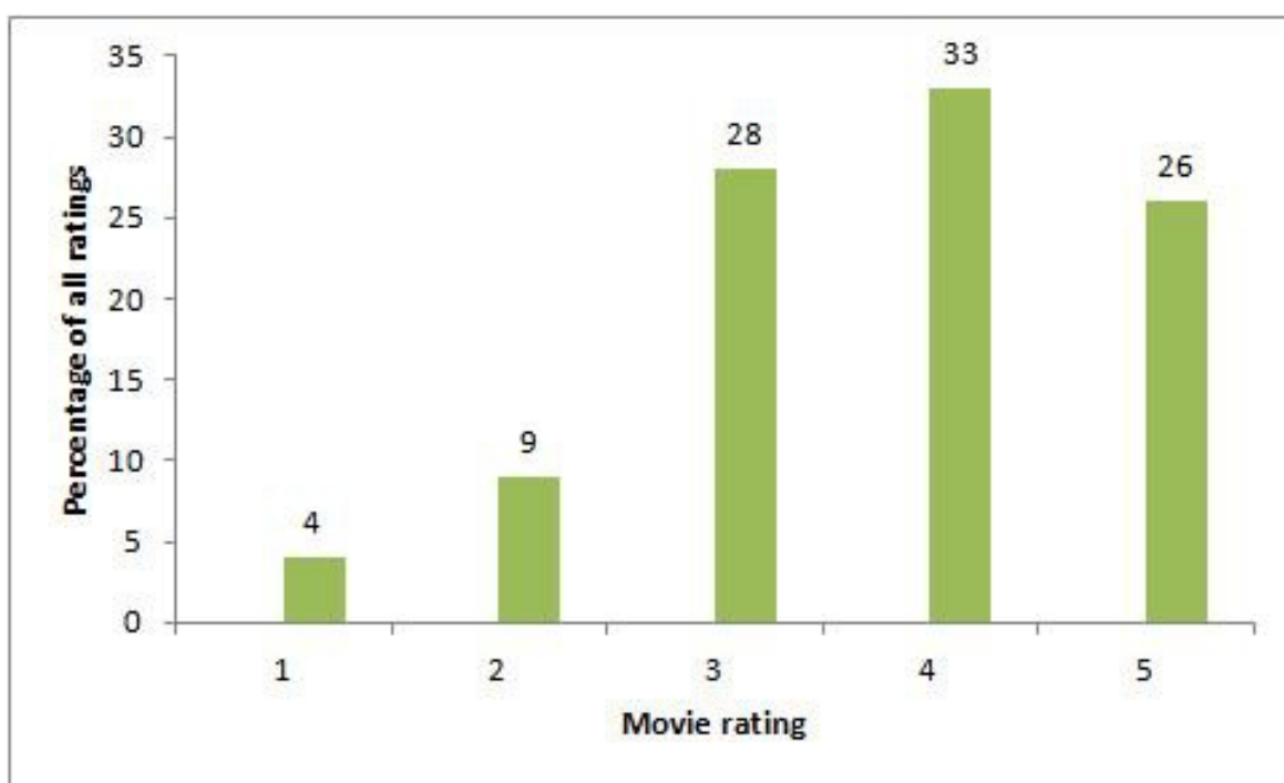
Figure 1: Distribution of ratings in the Netflix Prize data set

Figure 1 is the distribution of ratings for the Netflix Prize data set. Netflix ratings are not a reputation system in the sense used here, in that they are not testimonials about people: the data set consists of ratings of movies and TV shows by Netflix customers. There is every reason to believe that the ratings are independent and honest: the rater can offer an opinion freely, having no reason to expect reward or punishment for any particular rating. The rater also has an incentive to give a rating that matches their actual opinion, as it enables Netflix to recommend movies that better match their tastes. So Figure 1 can take this as a reasonable distribution of independent ratings.