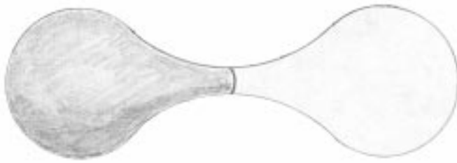
FIGURE 1. The isoperimetric inequality (5.3) can fail for curves as long as the shortest geodesic, which bounds lots of area.