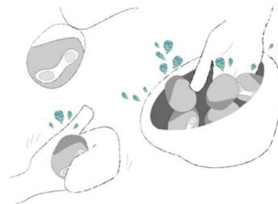
Figure 3: The Sonic Gem recorder and Sonic Gem Bowl

Opportunistic and unobtrusive sound recording of precious domestic sounds could be supported through the use of physical sonic gems. These are small handheld objects modeled on precious stones which represent sound recordings in tangible form. Each gem has a wireless memory chip in it which interacts with a recording and playback device. A wearable recording device on a pendant or bracelet holds one gem (Figure 3). In default mode, it records and erases continuously, storing a minute of sound behind the current time on the chip in the gem. It has two buttons for retrospective and prospective sound capture. Pressing the retrospective capture button archives the last minute of recorded sound. Pressing the prospective capture button starts a new sound recording until pressed again. Once recorded, a sound can be reviewed or deleted on the pendant itself, or kept safe in the gem by removing it from the pendant. Recorded gems can be displayed in a bowl (Figure 3), which plays back the corresponding sounds as a gem is moved past a sensor. An overview of the sounds can be obtained by rummaging through the gems.