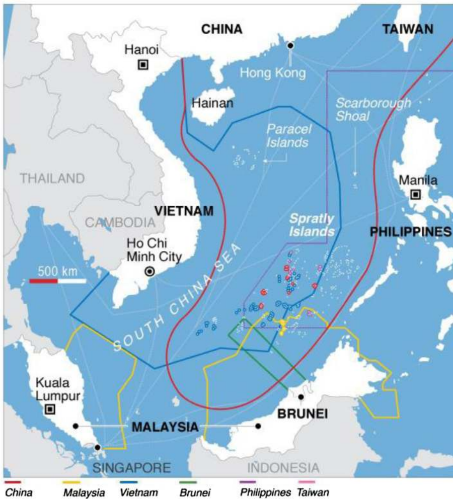
Figure 1. Disputed claims in the South China Sea.

nationalist historical residue, purposively ambiguous in its intended effect, probing of international reactions to maritime expansionism. But – following Duara (1995, 65) – it may also represent a more profound intention to “transform a society with multiple representations of political community into a single social totality... [through] the hardening of social and cultural boundaries around a particular configuration of self in relation to an Other”. Crucially, “historical and cultural resources are mobilized in [such a] transformation” in order to manufacture a sense of a linear historical process – the selective resurrection of fragments of a Chinese national consciousness formed during the Nationalist Guomindang Government’s nation-building efforts (65).