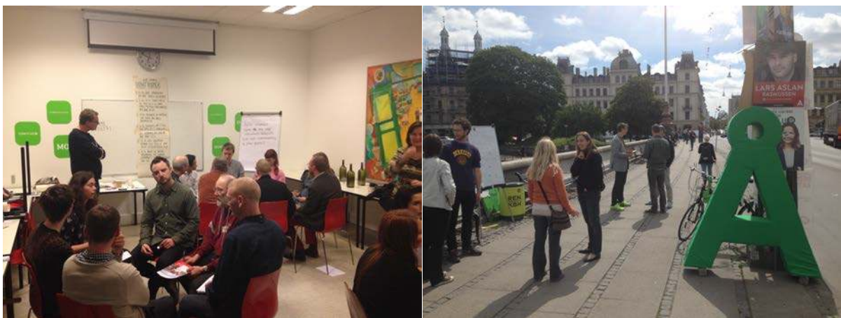
Figure 1: Examples of political laboratories

There are few formal requirements for how to conduct Political Laboratories. Instead, the idea is to encourage ordinary citizens to take the lead in developing The Alternative's policies. Political Laboratories may therefore assume any shape, take place at any time, and involve any kind of activity. For instance, one of the laboratories that we observed was organized by members of the political leadership, took place at a public school, and lasted a full afternoon; another was spontaneously organized by an ordinary member, took place at a bridge in central Copenhagen, and involved passersby responding to a single question.