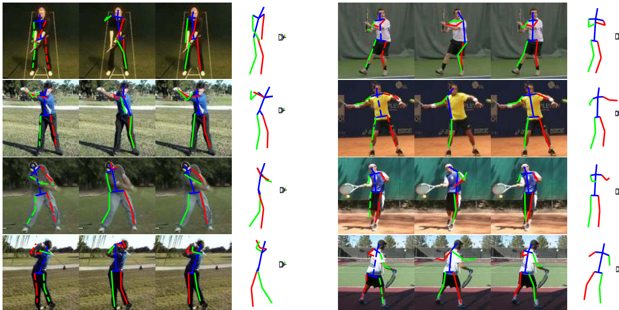
Figure 3. Example results on PennAction. Each row includes two examples. In each example, the figures from left-to-right correspond to the ground truth superimposed on the image, the estimated pose using the baseline approach [50], the estimated pose by the proposed approach, and the estimated 3D pose visualized in a novel view. The original viewpoint is also shown.