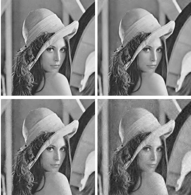
Figure 2. Reconstruction example for Lena in spread spectrum acquisition setting ( M = 0.2N , ISNR = 30 dB). From left to right and top to bottom: original image, reconstructed images for SARA (28.1 dB), RW-TV (26.3 dB) and BPDb8 (21.4 dB).

augmented with the Dirac basis as the brain is quite localized in the field of view. Figure 3 shows a zoom of the original brain image and reconstructed images for SARA and TV, which yield the two best reconstructions in SNR. In addition to an SNR gain of 1.5 dB, SARA achieves an impressively better reconstruction from the visual standpoint.