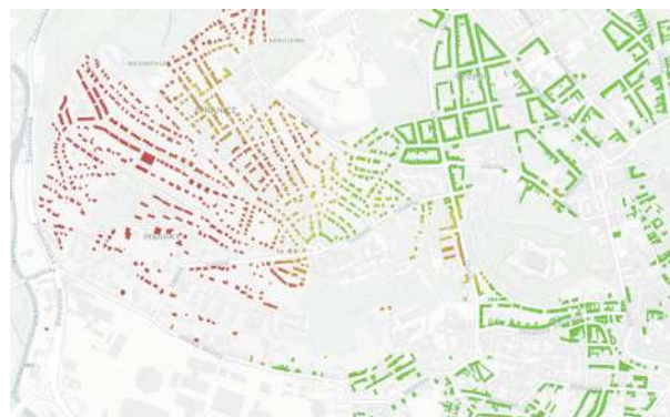
5: Example of results for Shopping and services indicator. Note changes in values between the city center and periphery.

I: Results of accuracy evaluation. The value represents a difference between the calculated index and user opinion about a locality.