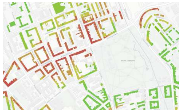
4: Example of results for Environment – Ecology indicator. Note changes in values around a frequented road vs. a park area.