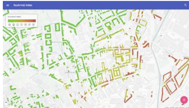
3: Application shows calculated main index evaluation on a real-estate base layer.

in the area etc.). There is no precise value, which would describe, when a shop or restaurant is “too distant” or how many shops are necessary for “good” public services.