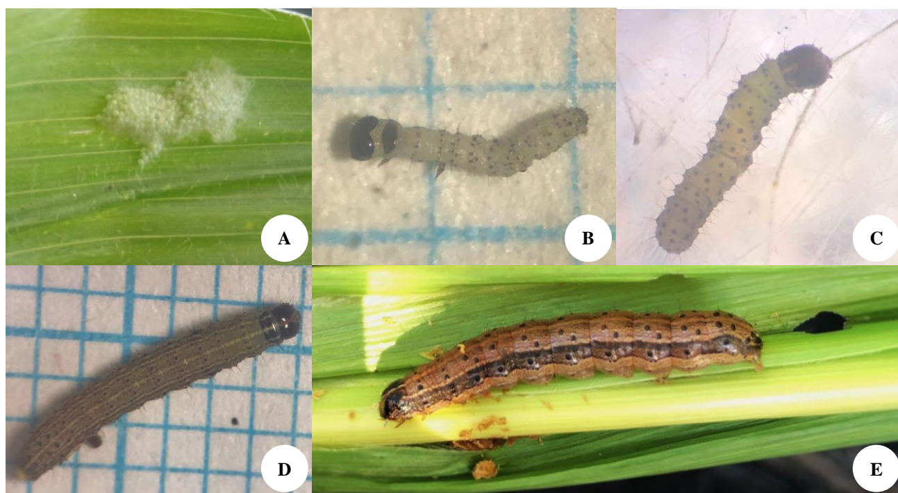
Figure 1. Egg and larval stage of Spodoptera frugiperda . A. Egg, B. 1 st Instar, C. 2 nd instar, D. 3 rd instar, E. 6 th instar. arrow: inverted Y shape on the head, circle: four black dots (pinacula) in the eighth segment