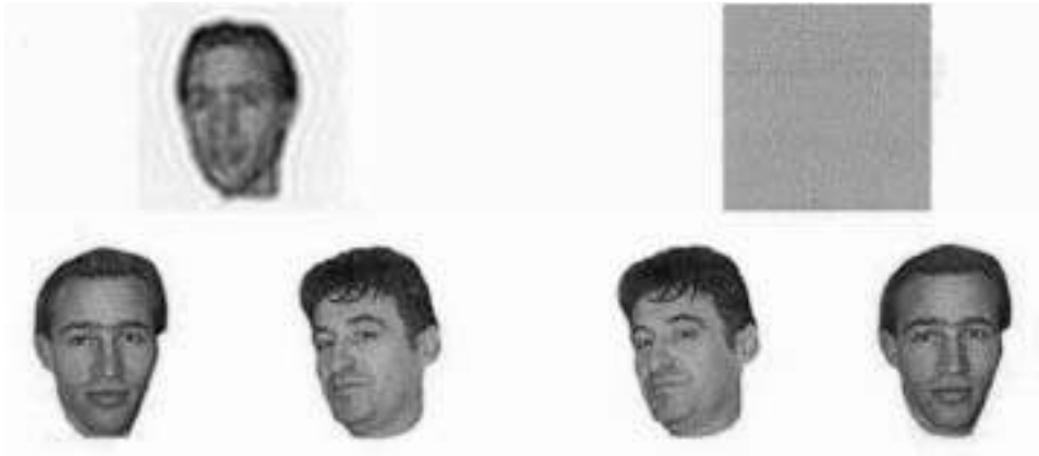
Fig. 2. Example of stimuli used in the high- (right side) and low-pass filtered (left side) condition in experiment 2.