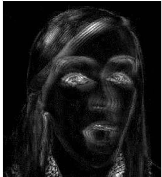
Figure 2: Five-frame composite visualization of the speaker’s head and facial movements as captured by movement amplitude across the first peak shown in Figure 1.

In processing our data we also convert MA measurements to z-scores per speaker to allow for comparable measurements in spite of differences across recording conditions such as speaker distance from the camera, color of the background and speaker clothing, and so on. As with our acoustic variables, for each video we extract an MA maximum, mean, minimum, and standard deviation for each PBU.