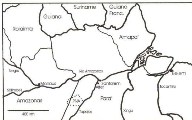
Fig. 1. Map of the study locations, near Santarém, Pará State, Brazil. (Alter) Alter do Chão, (PNA) Amazon National Park.