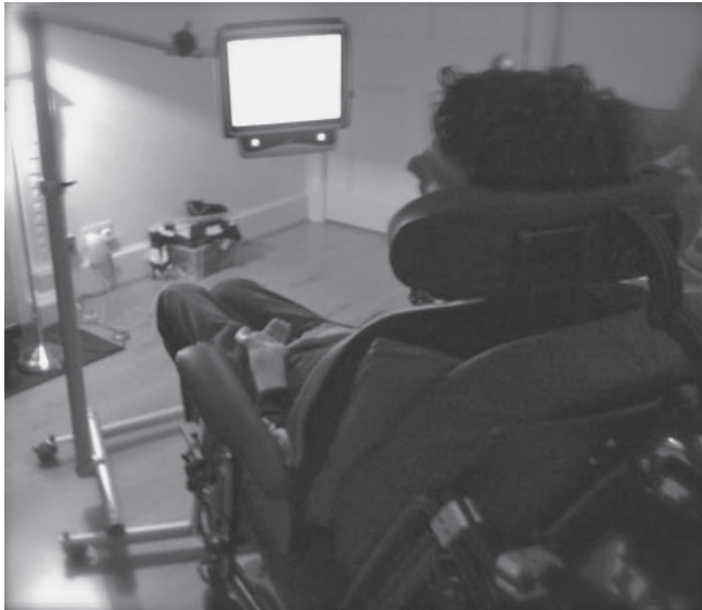
Fig. 2 The reconstructed synthetic voice was installed onto patient's VOCA.

Sheffield [16] and a patient with MND in Edinburgh. The patient in Edinburgh had had MND for three years at that time of recording, which consisted of five minutes of an informal interview in the quite office environment. We created his personalized synthetic voice from this short recording. Various components of this model were substituted by components from a model constructed from his brother's voice. Feedback obtained from the patient's family after we installed his reconstructed voice into his VOCA device (Fig. 2) was very positive. The samples of repaired voice are available online [22].