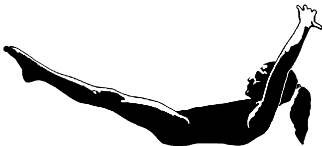
Figure 1. Gymnastics hollow position. Requires scapular protraction, thoracic hyperkyphosis, and anterior pelvic tilt.

A high rate of underlying spinal pathology is noted in the gymnastics population (13,16,17,35,36,46). When observing abnormalities on imaging studies in athletes, a common question is whether the pathology is the cause of the athlete's pain. With a high prevalence of radiologic abnormalities in the gymnast, answering this question becomes