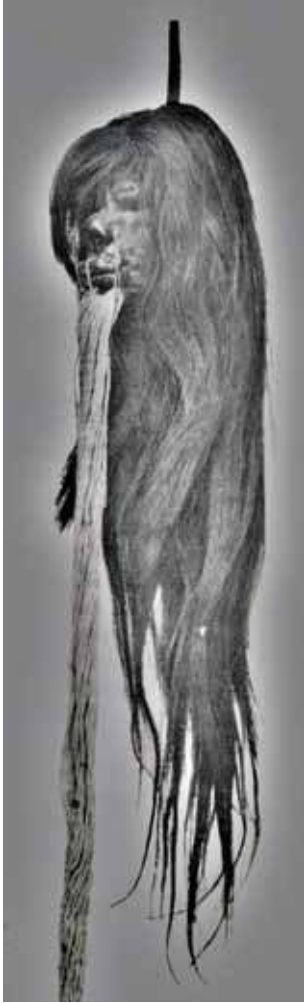
South American Jivaro-Indians are famous of their shrunken heads. Headhunting was common in South America, while scalping was practically unknown. The photograph is computer enhanced by the author from Birket-Smith 1972.