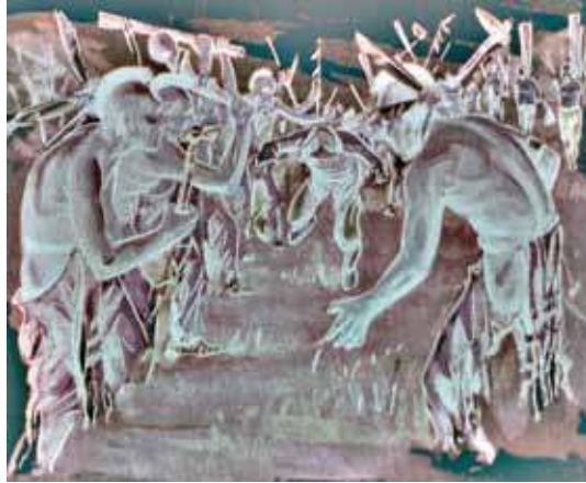
An artistic view of running the gauntlet, a test almost every male captive was forced to pass in the Eastern Woodlands. Original painting is computer enhanced by the author from Löfgren 1959.

were also highly valued. The Eastern Woodlands tribal world is very characteristic in this matter. Women and children were the prime targets as captives, not to be killed or tortured, but to be adopted into the tribe. Actually this adoption became institutionalized in the course of bloody tribal warfare, where numbers of casualties were sought to be compensated in this way. At least during colonial times when the tribal