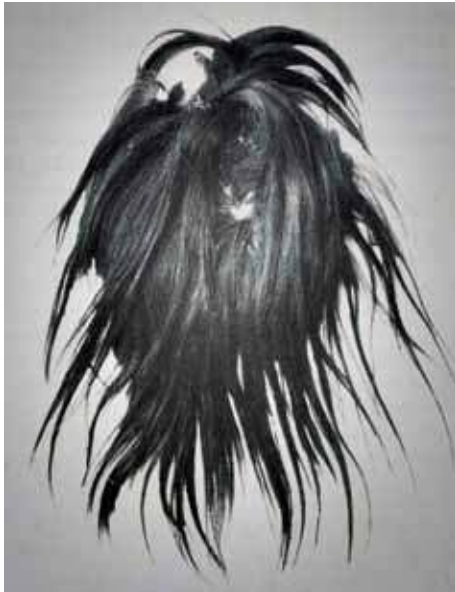
A genuine scalp (National Museum of Denmark). The photograph is computer enhanced by the author from Birket-Smith 1972.

best however. And now, this historical panorama is changing once again. Starting this time in the 1980s, and in the field of archaeology especially, a completely new set of insights have arisen. Anthropologists are also reading their documents anew by using Ockham's razor instead. And what is the consequence of this?