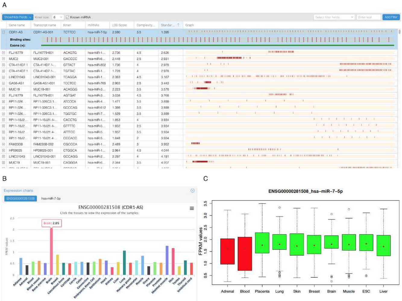
Figure 2. spongeScan output generated for the example data set. (A) Application table showing pairwise enrichments of miRNA canonical seeds in lncRNA sequences. This view only shows a few of the total possible columns containing data and scores. (B) Expression data representation for the first pair CDR1-AS and miR-7-5p. The expression data are grouped by tissue and, when clicked, it will show the expression of all the samples in the tissue. (C) Expression levels of mRNA targets of miR-7 for different tissues as a function of the CDR1-AS expression. Red box-plots correspond to tissues where the lncRNA is not significantly expressed, whereas the green color indicates expression of the lncRNA in the tissue.

observed that validated lncRNA–microRNA pairs in this database usually have scores from 0.4 to 1.0. We searched the top 100 results on our human example data and found that most (81%) of our predictions were in the lncBase, having an average score of 0.84 in this database (Supplementary Table), what supports our prediction results with an independent resource.