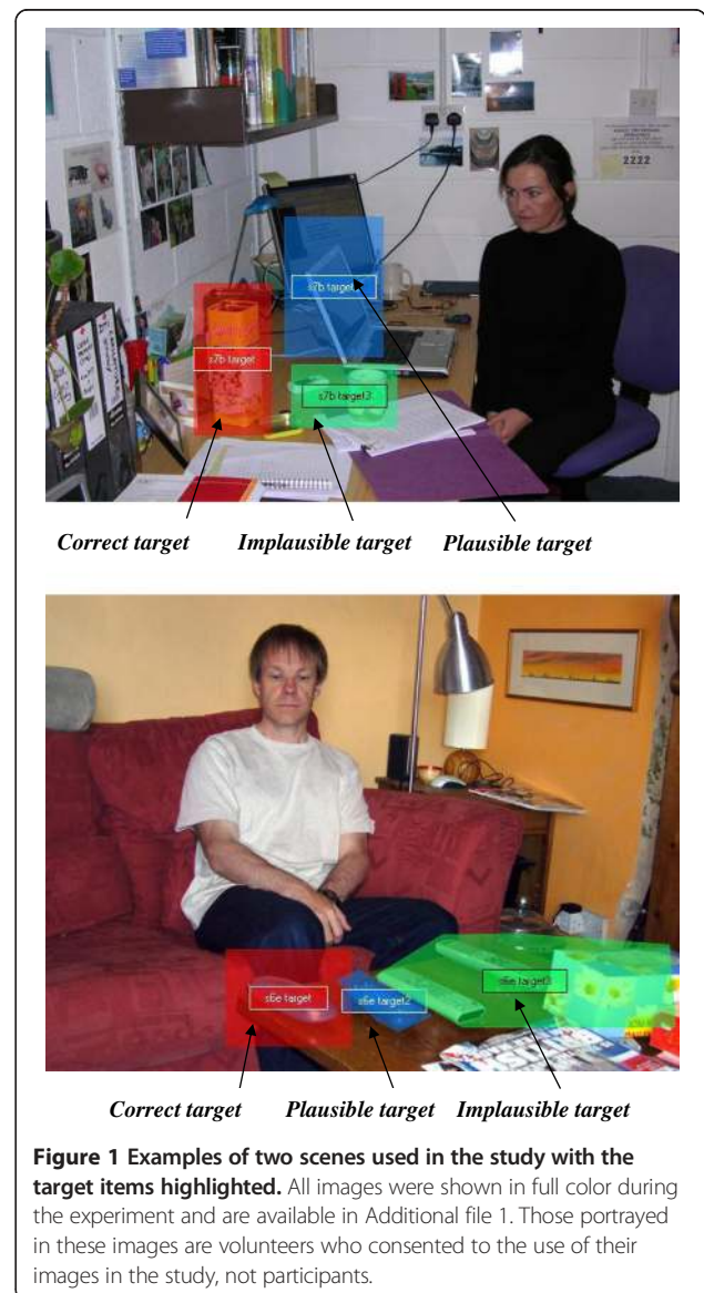
Figure 1 Examples of two scenes used in the study with the target items highlighted. All images were shown in full color during the experiment and are available in Additional file 1. Those portrayed in these images are volunteers who consented to the use of their images in the study, not participants.

in Additional file 1. The TobiiStudio package exported gaze fixation duration (milliseconds) to each AOI across scenes for each participant. We also recorded the time to first fixation on each AOI; these data are reported in Additional file 2.