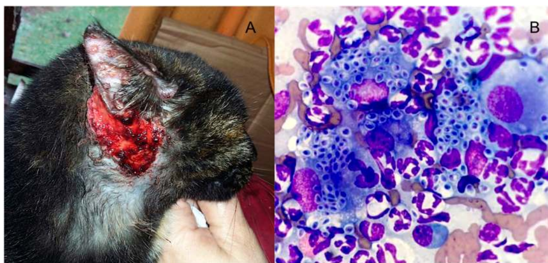
Figure 3. Ulcerated and papular vesicular lesions in the head and ear of a cat with proved Sporothrix brasiliensis infection (A). Cutaneous feline lesions are highly infective and harbor a great number of yeast cells of the fungus. Feline sporotrichosis can be easily diagnosed by secretion direct exam stained Giemsa \times 1000 (B).

In contrast to immunocompetent patients, where direct mycologic or histopathologic exams show poor sensitivity, in immunocompromised hosts these methods may depict higher sensitivity, especially in AIDS patients with very low CD4 cell counts [83,84]. In severely immunocompromised AIDS patients, cutaneous and lymphatic lesions may depict a big fungal burden, similar to that observed in cats with S. brasiliensis infections [7,134] (Figure 3). Immunocompromised patients with cutaneous disseminated and extracutaneous clinical forms may depict Sporothrix spp. yeasts under immunofluorescence, Giemsa, Gram, Grocott-Gomori and periodic acid Schiff (PAS) stains. When observed, yeasts present round to oval and elongated “cigar shape” forms [2,10,135,136]. Non-microbiologic diagnostic tests such as immunoelectrophoresis, immunodiffusion, ELISA and DNA sequencing PCR methods are very important for typical and immune reactive forms but the only commercially available test for immunodiagnostic of sporotrichosis is the latex agglutination technique [10,137,138].