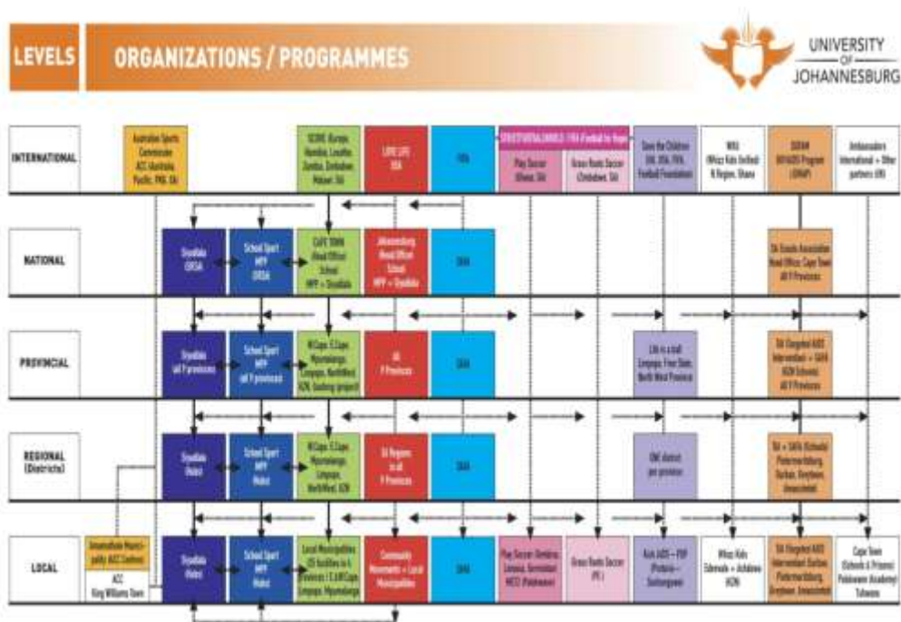
FIGURE 3: MULTILEVEL SPORT-FOR-DEVELOPMENT PROGRAMMES IN SOUTH AFRICA

In such multilevel and diversity in stakeholder collaboration, the ties will be relatively weak and in need of seeking to deliver on mutual outcomes. The delivery and success of the corporation will largely be met by the partnerships, and within the diversity of partnerships, GTZ brand and donor-inspired expectations will transpire. The success of collaborative work will inevitably lie within the collective association and goal achievement within a particular network of partners.