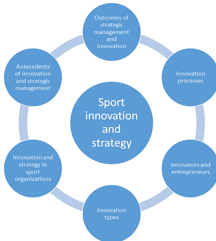
Figure 2. main article themes of the literature on sport innovation

In this part of the literature review, I move from describing the characteristics of the literature to analyzing the themes, topics and content of the reviewed literature on sport innovation. Reading the published articles on sport innovation, some central topics appeared to be reoccurring. From an inductive research approach (Tjora, 2010) some main themes were determined in the reviewed literature. These main themes of research on sport innovation and strategy were then divided into six different categories: 1) Outcomes of strategic management and innovation, 2) innovation processes, 3) innovators and entrepreneurs, 4) innovation types, 5) innovation and strategy in sport organization and 6) antecedents of innovation and strategic management. These central topics are here illustrated in Figure 2.