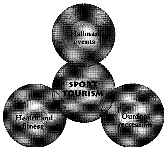
Figure 1. Related contextual domain

To a large extent, it is these three characteristics that make sport tourism such an interesting area for research. The systematic exploration of the relationship between these characteristics of sport and the characteristics of the spatial and temporal dimensions of tourism has the potential to provide significant insight into this phenomenon. Prior to this discussion, however, it is necessary to consider the merit of sport as a central attraction of tourism.