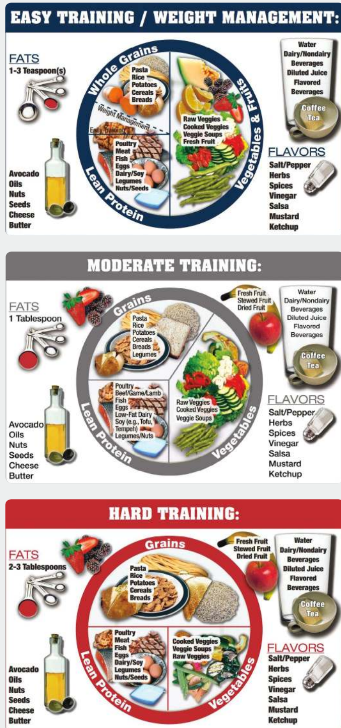
Figure 1. The Athlete’s Plate nutrition education tool

The impact of RED-S can be significant, and its effects may result in medical presentations with differing signs and/or symptoms. The direct evaluation of RED-S is complicated by the methodological challenges associated with reliably quantifying energy intake, energy expenditure and fat-free mass. For female athletes, irregular or absent menstrual cycles are an obvious clinical indicator of insufficient energy availability. In addition, decreased testosterone/oestrogen and/or thyroid hormone triiodothyronine (T 3 ), or an increase in cortisol, offer potential hormonal assessment parameters of RED-S. However, there is no absolute threshold of low EA that results in amenorrhoea in females or low testosterone in males. Therefore, an individual clinical evaluation including discussion of nutrition attitudes and practices, combined with menstrual history for females and endocrine markers for male and female athletes, is suggested. 8 In an attempt to simplify the complex clinical assessment and return-to-play decision-making process, the RED-S Clinical Assessment Tool (RED-S CAT) 8 has been developed (Table 1). The tool provides a simple evaluation of RED-S risk that is easy to implement, based on three categories: ‘red light’ = cease participation, ‘yellow light’ = compete medical clearance/train under supervision, ‘green light’ = full participation.