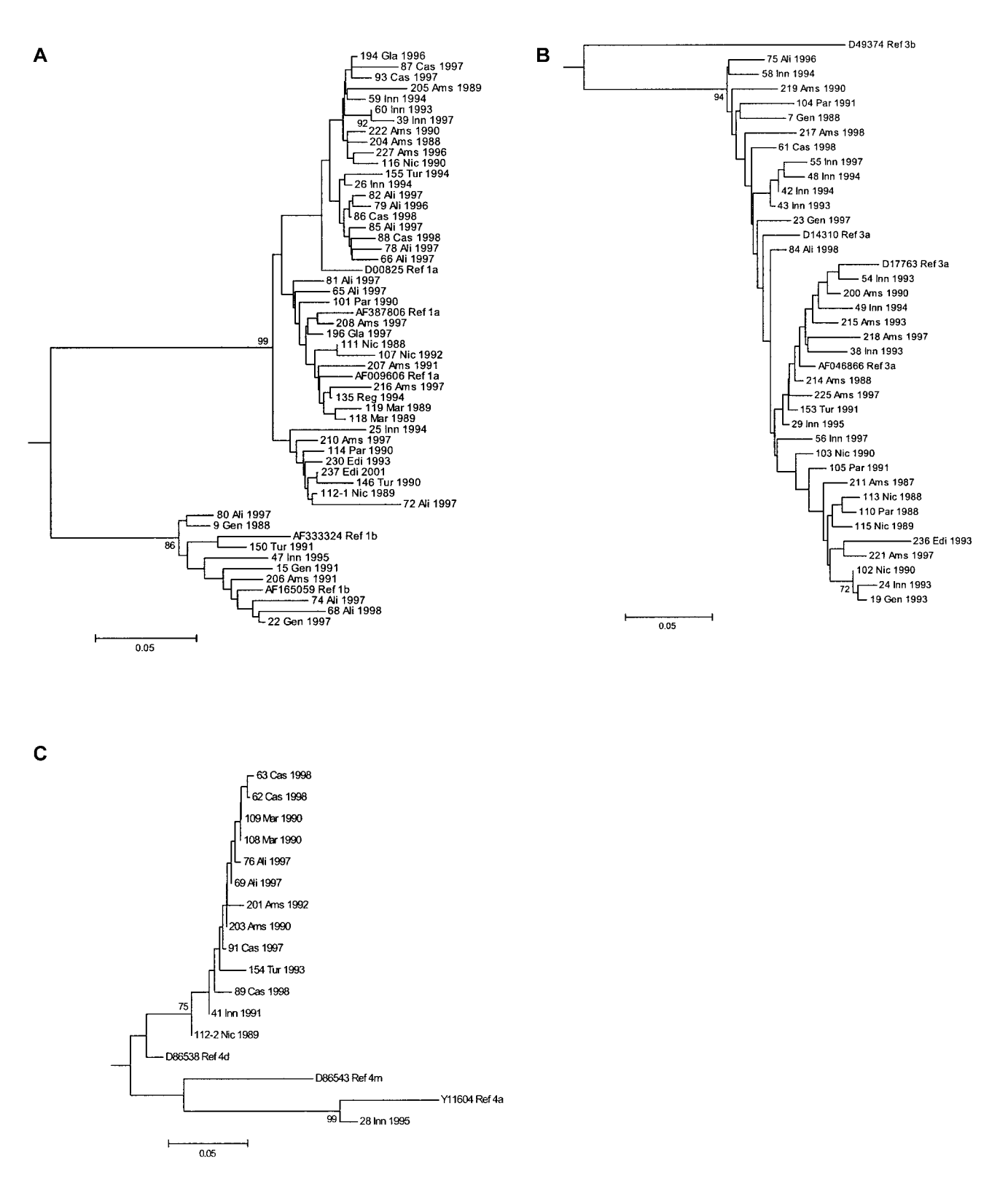
Figure 1. Neighbor-joining tree based on the Tamura-Nei substitution model with a \gamma distribution ( \alpha = 0.40 ). Bootstrap values higher than 70 are shown (n = 1000). A , Hepatitis C virus (HCV) NS5B genotype 1. B , Hepatitis C virus NS5B genotype 3. C , Hepatitis C virus NS5B genotype 4.