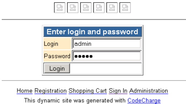
Figure 1. Example login – Normal case