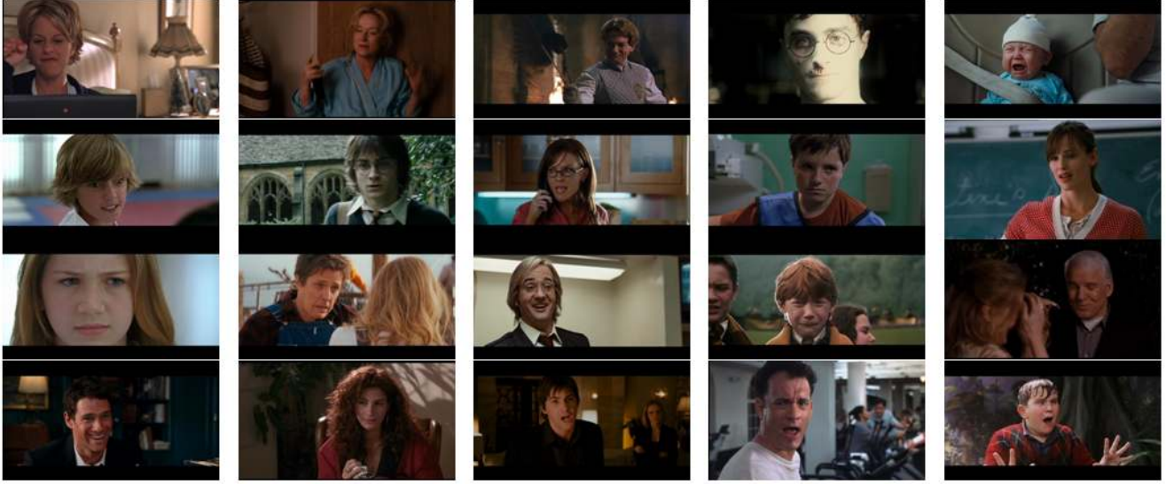
Figure 1. Sample images from the SFEW database.

The CMU Pose Illumination and Expression (PIE) [21] database is another popular and widely used database. It contains facial expression images posed by 68 subjects. Similar to PIE is the Multi-PIE [10] database, which contains 337 subjects. The main limitation of these databases is that they have been recorded in lab-controlled environments. Figure 2 contains some sample frames from the JAFFE and Multi-PIE datasets. It is evident from the figure that these samples do not represent the real world conditions.