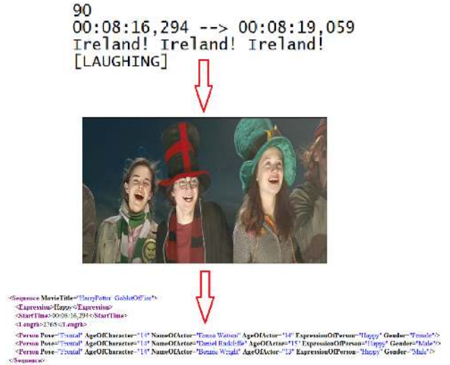
Figure 3. The screenshot described the process of database formation. For example in the screenshot, when the subtitle contains the keyword ‘laughing’, the corresponding clip is played by the tool. The human labeller then annotates the subjects in the scene using the GUI tool. The resultant annotation is stored in the XML schema shown in the bottom part of the snapshot. Note the structure of the information about a sequence containing multiple subjects. The image in the screenshot is from the movie ‘Harry Potter and The Goblet Of Fire’.

for six basic expressions angry , disgust , fear , happy , sad , surprise and the neutral class. The database can be downloaded at: