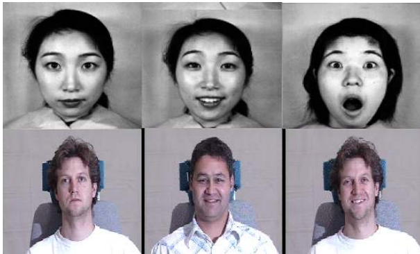
Figure 2. Sample images from the JAFFE and Multi-PIE databases. Note the controlled environment, in which they were recorded.

SFEW has been developed by selecting frames from AFEW. The database covers unconstrained facial expressions, varied head poses, large age range, occlusions, varied focus, different resolution of face and close to real world illumination. Frames were extracted from AFEW sequences and labelled based on the label of the sequence. In total, SFEW contains 700 images and that have been labelled