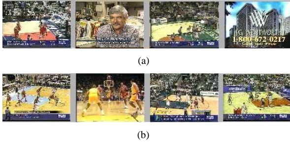
Fig. 2. First 4 ranked results for the query “Basketball”.

Table 3 compares the performance of CRM and normalized CRM for three sets of queries. We observe that the latter method outperforms the former substantially, by 15%, 37% and 33% on the 1-, 2- and 3-words query sets respectively. For all three query sets the differences in precision are statistically significant at the 1% level according to the sign test. The precision at 5 retrieved key frames also indicates that using the latter method, there are half images relevant to the query in the top 5. We observe that normalized CRM consistently outperforms CRM over all query sets.