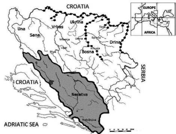
Fig. 5. Distribution of Misgurnus fossilis in Bosnia and Herzegovina based on literature data. Danube (or Black Sea) catchment (unshaded), Adriatic Sea catchment (shaded).

southern haplotype, that is closest to the Bosnia and Herzegovina, was located in the Poganovo polje (Croatia, Park of Nature Lonjsko polje). This sample revealed specific population different from all other samples and localities. Authors also considered that southern-eastern part of the range was a refuge area for the species during the glaciation events in the Pleistocene. Another ecologically similar lowland species Umbra krameri Walbaum, 1792, was shown to be also genetically different in the Sava River basin (Marić et al. 2017). Phylogeography of this species has been investigated in Danube and Dniester drainages, and it has been found that population from Sava River basin belongs to specific phyletic lineage (haplogroup) and could be considered as potential Evolutionary Significant Units (ESU). Therefore, it is possible that southern part (Bosnia and Herzegovina) of the M. fossilis population in Sava River basin could be slightly genetically different from all other populations, and could represent an evolutionary significant unit. This need further investigation.