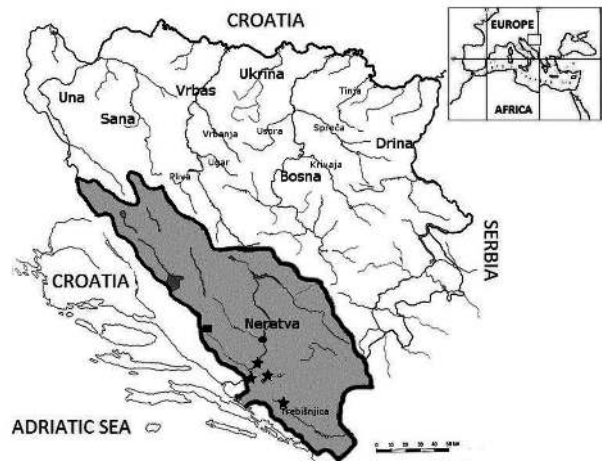
Fig. 4. Distribution of Cobitis illyrica , C. narentana and C. herzegoviniensis in Bosnia and Herzegovina based on literature data. Black rectangle indicate places where C. illyrica was recorded, black stars indicate C. narentana localities, while black dot shows record of C. herzegoviniensis . Danube (or Black Sea) catchment (unshaded), Adriatic Sea catchment (shaded).

Assesment of the extinction risk for the Bosnia and Herzegovina has not yet been made (Škrijelj et al. 2013), but the global estimation for C. illyrica is Critically Endangered (CR), (Freyhof & Kottelat 2008c).