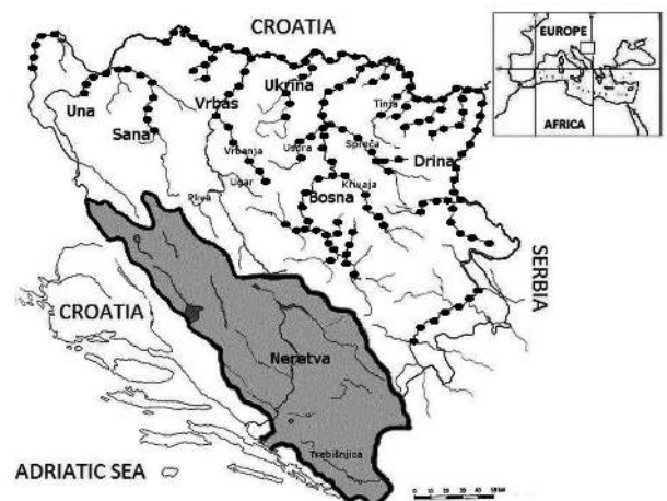
Fig. 3. Distribution of Cobitis elongatoides in Bosnia and Herzegovina based on literature data. Danube (or Black Sea) catchment (unshaded), Adriatic Sea catchment (shaded).

The main threats are habitat alteration, untreated sewage, pollution, the extraction of gravel from the river, water flow and level regulations, and the introduction of non-native species. It is included as the LC species in the IUCN Red List (Freyhof