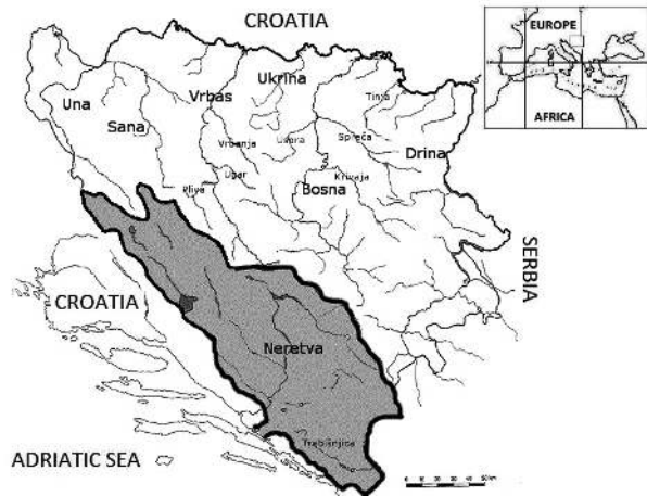
Fig. 1. Map of Bosnia and Herzegovina showing main catchments, Danube (or Black Sea) catchment (unshaded) and Adriatic Sea catchment (shaded).

distribution are very scarce, mostly based on species lists only lacking detailed descriptions of species and localities. According to the bibliographic data, a total of nine species of loach (eight Cobitidae and one Nemacheilidae) were reported from freshwaters within their geographical range (Vuković 1963, 1977, Bogut et al. 2006, Šanda et al. 2008a, b, Sofradžija 2009, Buj et al. 2014, 2015a, b, Golub et al. 2016). However, some of the data are in obvious conflict with the current taxonomy. Based on all available data it is clear that reports on the presence of Cobitis taenia Linnaeus, 1758 in Bosnia and Herzegovina are a result of taxonomic imprecision and it cannot be expected that this species inhabits waters of Bosnia and Herzegovina, because its distribution range is restricted to northern Europe (Nalbant et al. 2001). Bosnia and Herzegovina was thought to be a part of this species' range since C. taenia was considered to have extremely wide distribution through Palearctic region (Nalbant et al. 2001). However, already Bacescu (1962) reported C. taenia to be an assemblage of morphologically similar, but phylogenetically distinct species.