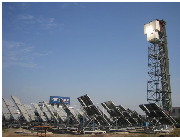
Figure 2. Nanjing's 70kW solar power tower system [46].

China's first CSP demonstration project, a 70 kW solar tower plant (Fig. 2) [45], was constructed by the Chinese Academy of Engineering near Jiangning in Jiangsu in 2006. The heliostats for this project were jointly developed by Nanjing Chunhui Ltd., Institute of Electrical Engineering (CAS), and Himin. Larger heliostats of 100 m 2 were also developed and used in a demonstration project of 1 MW size [46, 47]. A 50 MW photothermal project in Delingha was started in 2011, with Supcon Ltd as the main