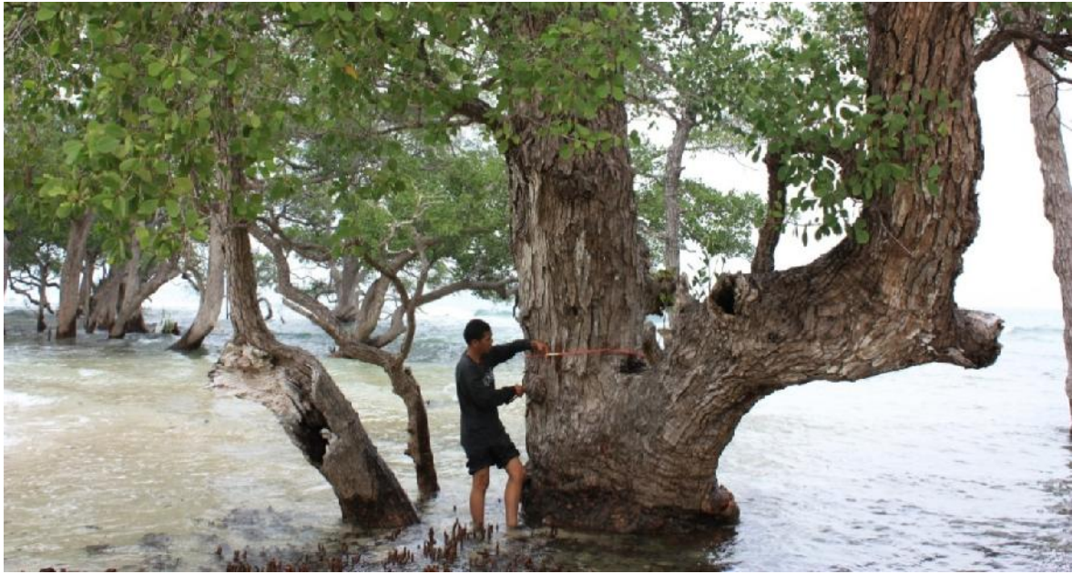
Figure 3. Large stand of Sonneratia alba in Lhok Mee, East Coast of Northern Sumatra stood firm against the 2004 tsunami. Most of the trees have more than 1 m in dbh.