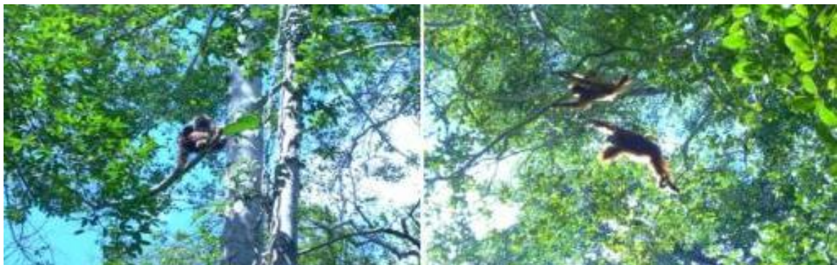
Figure 4. Sumatran orangutan populations stay in peat swamp forests in Singkil swamps. Some part of the forests were affected by tsunami, and the other hand the forests stood firm against the 2004 tsunami, and have capability in decreasing the impact of tsunami on coastal areas behind the forests.