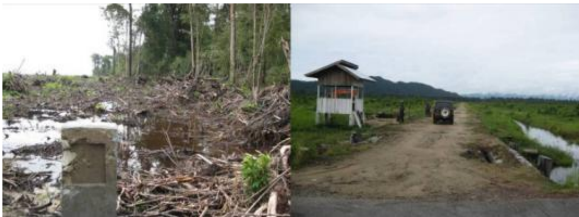
Figure 5. The coastal belt of peat swamp forests wiped out in several sites in the West Coast of Northern Sumatra few years after the 2004 tsunami disaster. When tsunami struck, the peat swamp forests were functionally as barrier. Large areas of green belt were erased and loss. Therefore, an integrated approach was needed in term of economic and ecological uses, including natural hazard preparedness.