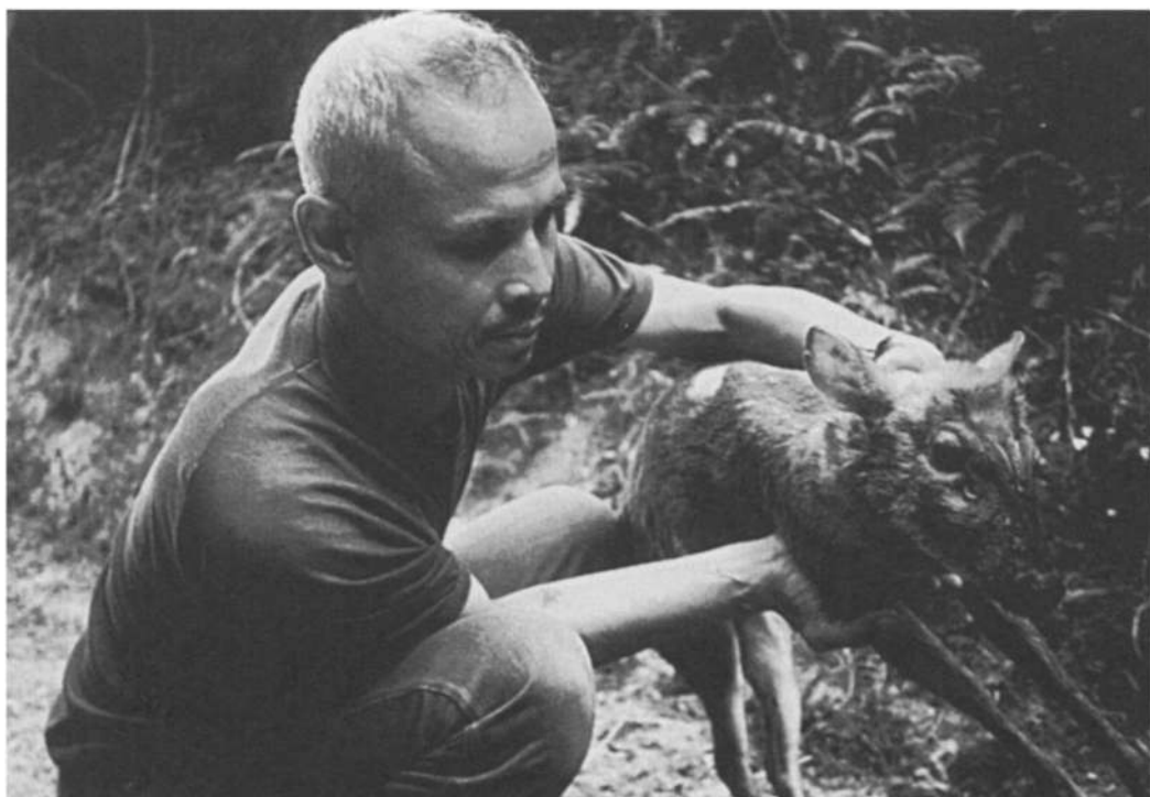
Right. A local hunter emerging from the forest with a freshly snared deer that was later identified as a new species, the leaf muntjac ( Alan Rabinowitz ). Above. Expedition team member with the adult female leaf muntjac killed by the hunter ( Alan Rabinowitz ).

medium-sized red barking deer, which was often seen in lowlands and edge habitat. There were also reports of a 'black barking deer' from the far north, beyond the Nam Tamai River. Eventual examination of specimens revealed that two of the deer are new species for Myanmar. The intermediate-sized red deer, which was locally abundant, was the Indian muntjac Muntiacus muntjak . Information on the two new species for Myanmar is given below.