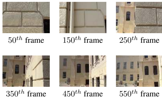
Fig. 2. Example frames from the left color channel of the “Wall” 3D shot.

The exploitation of disparity information, and, therefore, scene geometry, potentially leads to the extraction of more representative key-frames, since employing luminance information alone leads to different results than exploiting both disparity and luminance. Figure 2 shows example frames from the “Wall” 3D shot, where the camera pans horizontally from right to left, showing first a wall close-up and subsequently a building in long view. Thus, the shot is heavily differentiated in disparity but is mostly homogeneous in luminance and color characteristics, since the wall and the building have similar texture and reflectance properties. Figure 3 shows two key-frames ( K = 2 ) extracted from the “Wall”