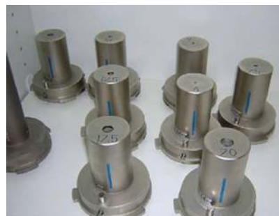
FIG. 2. Photograph of LINAC collimators.

All LINAC radiosurgery systems focus a collimated x-ray beam on a stereotactically identified target. The gantry of the LINAC rotates over the patient, producing an arc of radiation focused on the target. The patient couch is then rotated in the horizontal plane, and another arc is performed. In this manner, multiple noncoplanar intersecting arcs of radiation are produced. As in the Gamma Knife, the intersecting arcs produce a high target dose with minimal radiation delivered to the surrounding brain tissue. 11 Along with the LINAC rectangular colli-