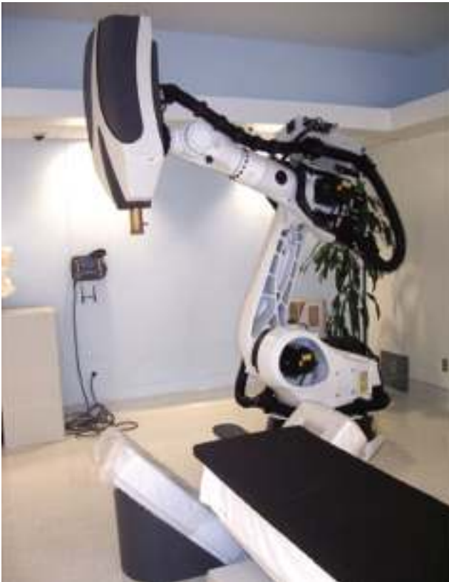
FIG. 4. Photograph of the CyberKnife: a LINAC with a robotic arm.

One of the first solutions for the requirement to spread out the radiation entrance path and minimize treatment delivery time was described by Ervin Podgorsak and colleagues at McGill University. 35 These investigators modi-