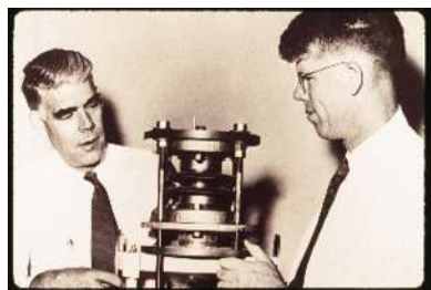
FIG. 1. Photograph of the Varian brothers with the klystron.

Ultimately, they constructed the Gamma Knife using cobalt radiation. 30 Leksell began treating patients with this device in 1957, calling the technique “stralkniven” (ray knives). 11,27 Other investigators worked with particle beam radiosurgery systems at the University of California at Berkeley and in Boston. 23,33