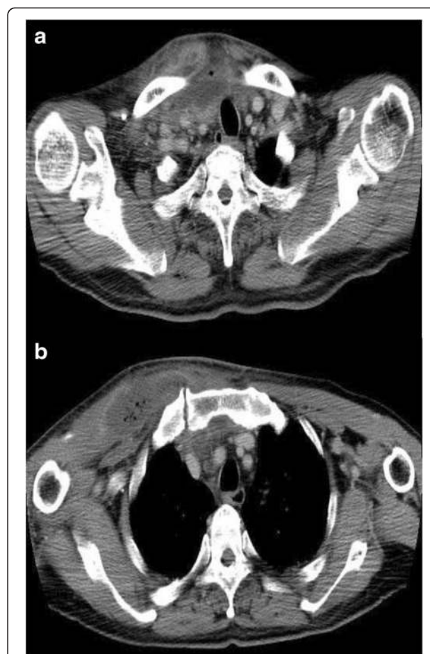
Fig. 2 Computed tomographic scans of the chest on admission. Computed tomography of the chest detected an abscess with air located below the thyroid gland and involving the right pectoral major muscle around the right sternoclavicular joint ( a , b ), as well as disaggregation of the right sternoclavicular joint ( b )

performed for wound granulation. After methicillin-susceptible S. aureus was identified in blood and wound cultures, broad-spectrum intravenous antimicrobial therapy was switched to intravenous cefazolin, which was continued for 6 weeks to treat osteomyelitis.