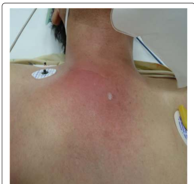
Fig. 1 Chest findings on admission. Redness and swelling of skin localizing to the sternoclavicular joint are shown

Emergency surgical debridement was performed. The skin incision began at the right border of the thyroid and extended to the head of the right clavicle. Operative findings included necrosis of parts of the right pectoralis major and minor muscles and the right SCJ. The patient also had right SCJ destruction. The necrotic pectoralis major and minor muscles and parts of the clavicle and manubrium near the SCJ that had become detached were debrided. The cavity was irrigated and packed open (Fig. 3). An initial Gram stain revealed gram-positive cocci. Ampicillin/sulbactam, which was given preoperatively, was changed to cefazolin (6 g/day), gentamicin (320 mg/day), and clindamycin (2700 mg/day) after surgery. On hospital day 6, methicillin-susceptible Staphylococcus aureus was cultured from blood and wound specimens. Antibacterial therapy was tapered to intravenous cefazolin and continued for 6 weeks to treat osteomyelitis (Fig. 4). On