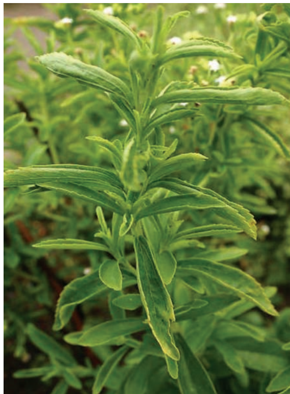
Plate 1 — Stevia rebaudiana

Stevia is native to the valley of the Rio Monday in highlands of North-eastern Paraguay in South America where it grows in sandy soils near streams on the edges of marshland, acid infertile sand or muck