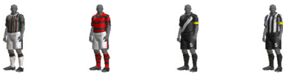
Figure 1. Figures representing the four popular soccer teams of Rio de Janeiro. (Fluminense, Flamengo, Vasco da Gama, and Botafogo).

The experiments were performed in a dimly lit and sound-proof chamber where the participants sat in front of a monitor at a viewing distance of approximately 57 cm. Responses were made on a computer keyboard using left (the letter “A”) and right (the number “6”) keys in the horizontal dimension. The index fingers were used to produce the experimental responses. The stimuli were realistic, full-color, three-quarter profile figures of soccer players (1.5° x 6.5°, width and height, respectively) that represented the four popular soccer teams of Rio de Janeiro (Fig. 1). Stimuli were randomly presented at 6.0° left or right from the fixation point. E-Prime software (version 2.0) was used to present the stimuli and record MRTs. Importantly, the feature that indicated a correct response was the team shirt (two among Flamengo, Botafogo, Vasco, or Fluminense), not the affective valence (Favorite/Rival).