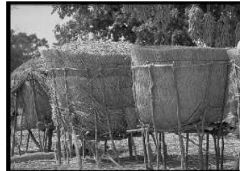
Woven basket (Cameroon)