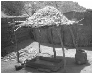
Open Platform (Cameroon)

The structure used for grain storage depends on the level of storage: On-farm, village and city or central. On farm storage involves individuals, while village storage may implicate individuals (family granary) or a group of individuals (community stores) (Fig. 2). The city and central storage facilities include large warehouses and are usually own by government agencies or non-governmental organizations (national or international). They are usually built with expertise from the developed world. Since most grains in Africa are produced by rural farmers, storage at the farm/village level will be emphasized in this paper. It is also at this level that traditional structures typical to Africa could be better discerned.