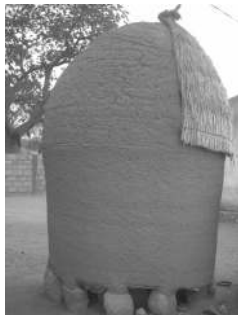
Mud Rhombu (Cameroon)