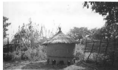
Mud Rhombu (Nigeria)