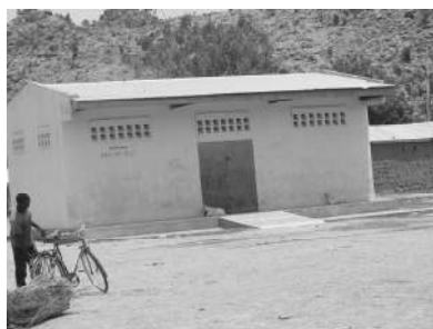
Community store (Cameroon)