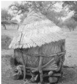
Woven Basket (Burkina Faso)