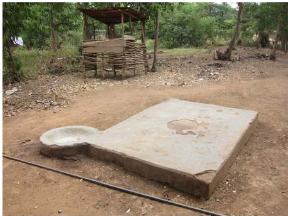
Fig. 1 - Slaughter slab in a rural ward

workers and butchery facilities meet required standards, although the implied frequency with which they carried out such visits varied from ‘occasionally’ to daily and duration of these visits was not commented on. Standards which respondents emphasised included that workers wear uniforms and have clean bills of health and that butcheries are outfitted with tiled walls, plastic chopping boards, electric or manual meat saws, running water and screens 6 to protect meat from flies and contaminants. HOs also inspect butcheries and eateries for health and hygiene standards, checking that premises are generally clean and that staff have current medical certificates. While no respondents mentioned enforcing standards relating to slaughter process, government documents advocate particular methods, such as regular sterilization of knives, and careful isolation of gut contents [53]. When encountering non-compliance – unstamped meat for sale, or butcheries without handwashing facilities for instance – LEOs and HOs are responsible for meting out sanctions such as fines, condemning meat or closing offending businesses.